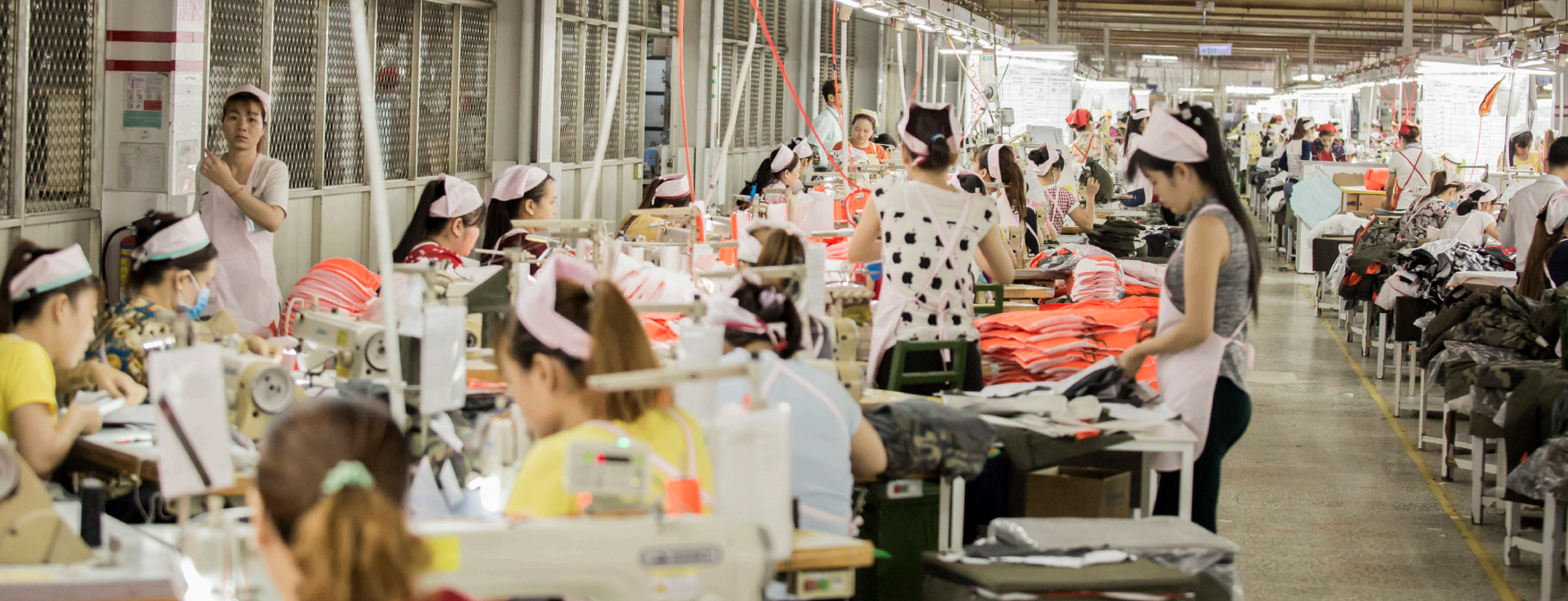
Female workers in the Pro Kingtex textile factory in Pou Yuen industrial zone, Tan Binh District, Ho Chi Minh City.