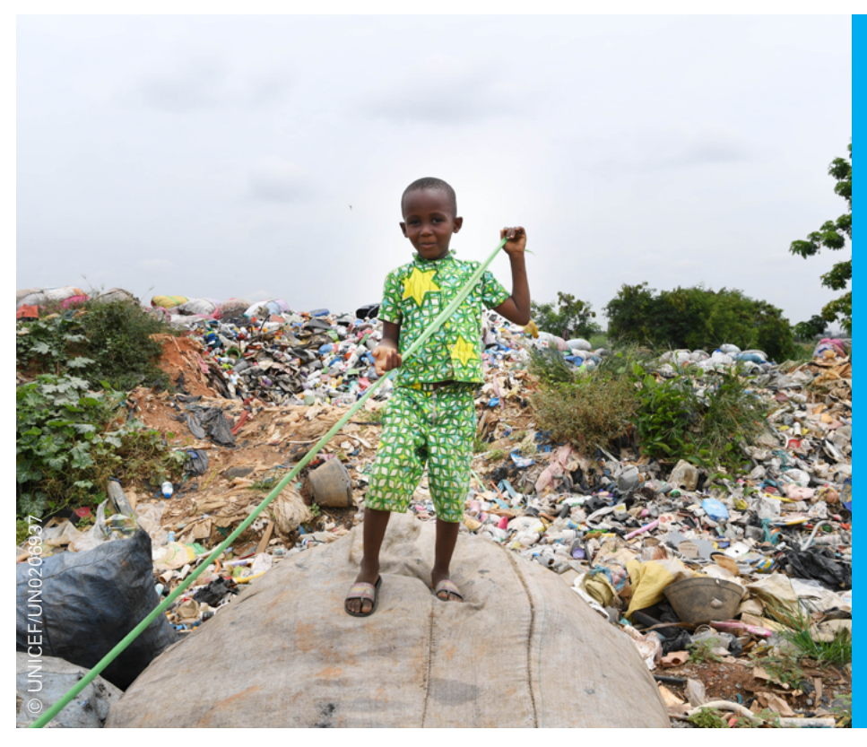
Child playing in a landfill in Abidjan, Côte d'Ivoire.

directly will most often not be necessary and should in any case always be done in consultation with experts to avoid risks of harm to children. However, lessons from companies with experience in child participation are included in section 4.